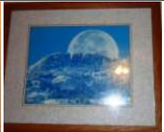
Moon Over Tooth, CO