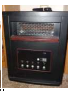
SPACE HEATER: QUARTZ