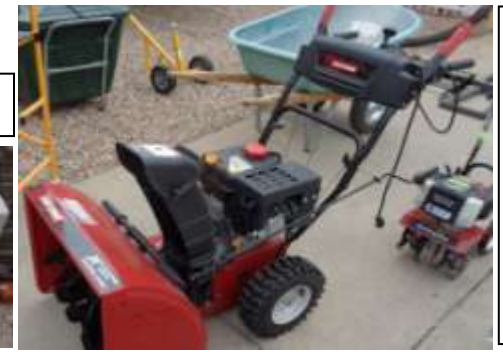
SNOW BLOWER: Craftsman 24" wide clearing, electric start, 4-5 years old