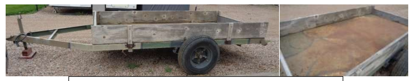
5x10 FLATBEAD TRAILER- Homemade Steel Bed 3,000 lb. axel