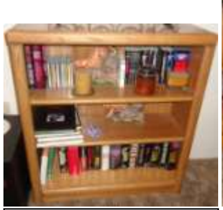
3 SHELF BOOK CASE, STEPHEN KING BOOKS