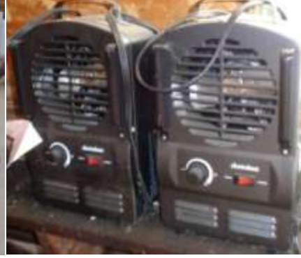
2-SPACE HEATERS: ElectraHeat