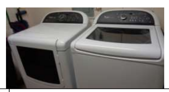
REFRIGERATOR: WASHER & DRYER: WHIRLPOOL, GΕ Cabrio Platinum