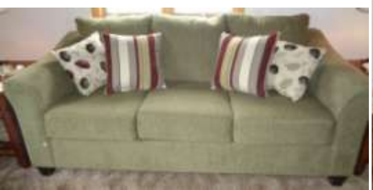
COUCH-2 Year Old, Sage, w/4 pillows