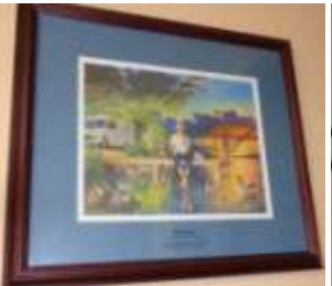
LITTLE DEBBIE: "My Time"