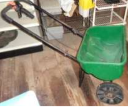
YARD SPREADER: Scott's