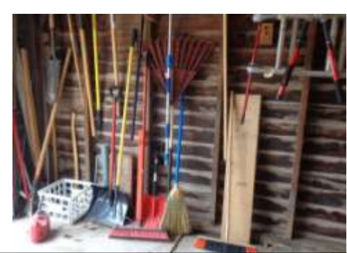
YARD RAKES, SHOVELS, BROOMS, HOE