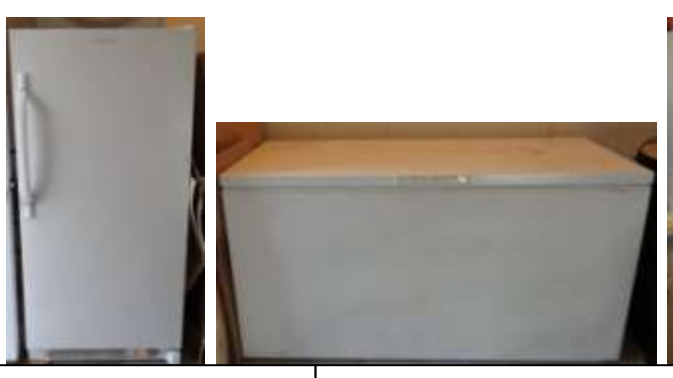
14' UPRIGHT FREEZER: Frigidaire 2007