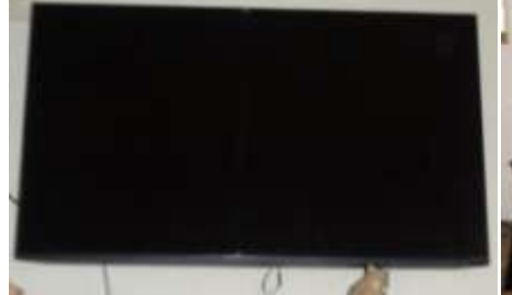
TV: VIZIO 50" 2016