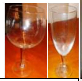
4 GOBLET/4 FLUTE