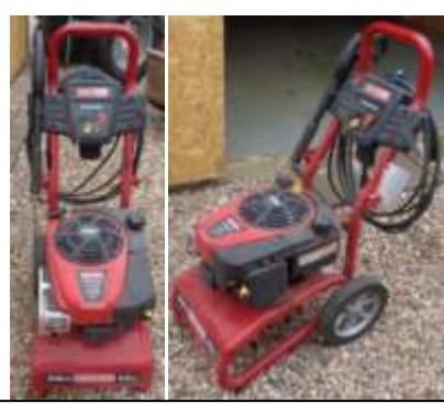
POWER WASHER: Craftsman 2700 Max Psi, 5 years old,2.3 Max, 6 pm