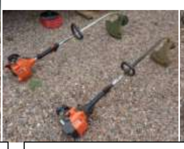
2 WEED TRIMMERS: Remington Echo