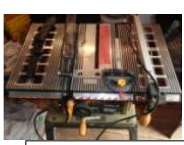
TABLE SAW: Shop Series & Accessories