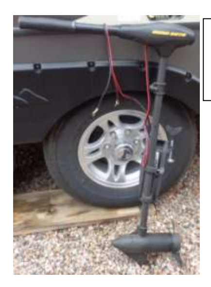
TROLLING MOTOR: Minnkota 5 speed w/Marine Deep Cycle Battery, 30 lb. thrust