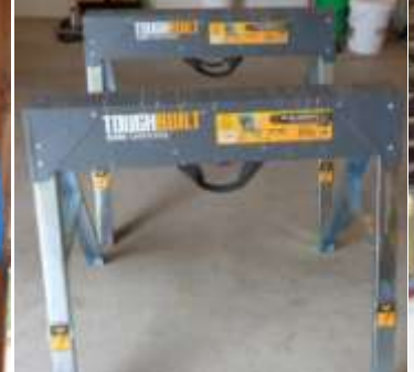
Folding SAW HORSES: 800 lb capacity, ToughBuilt