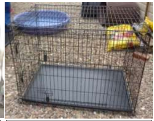
DOG KENNEL: Folding XL