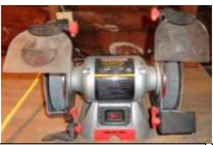
BENCH GRINDER: Tradesman 6" w/dual work lights