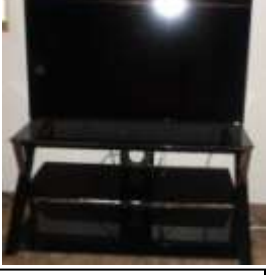
TV: VIZIO 37"