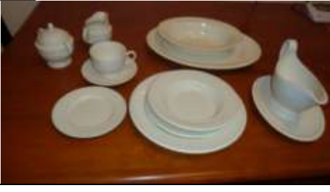
WEDGWOOD CHINA COMPLETE SET (8PC SETTING)