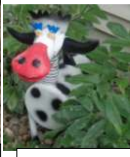
YARD ART: COW