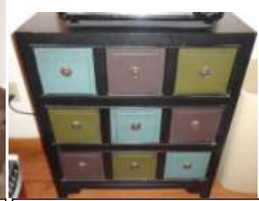
3 DRAWER CHEST