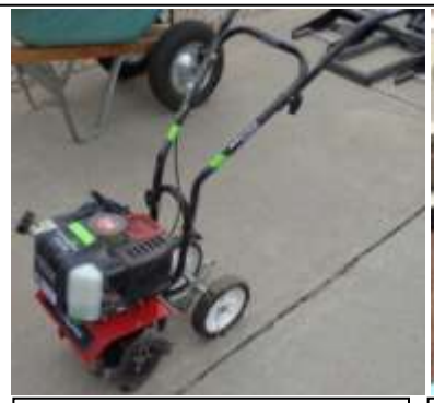
TILLER: Earthquake 2016