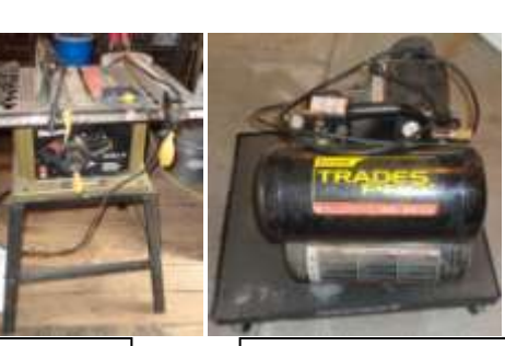
AIR COMPRESSOR: Trades Pro 5 gal, 115v with hoses