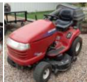
42" Craftsman Rider with Bag & Spare Blade DYT 4000