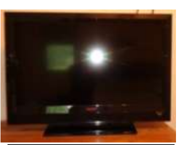
TV: VIZIO 32"