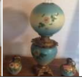
GONE w/the WIND LAMP