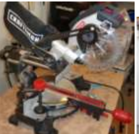
MITER SAW WITH STAND: Craftsman, 2017