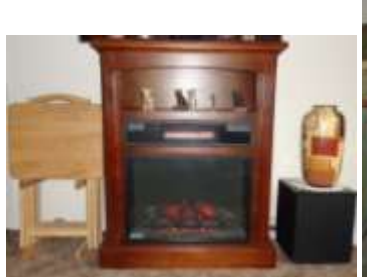
ELECTRIC FIREPLACE, WOOD TRAYS, VASE