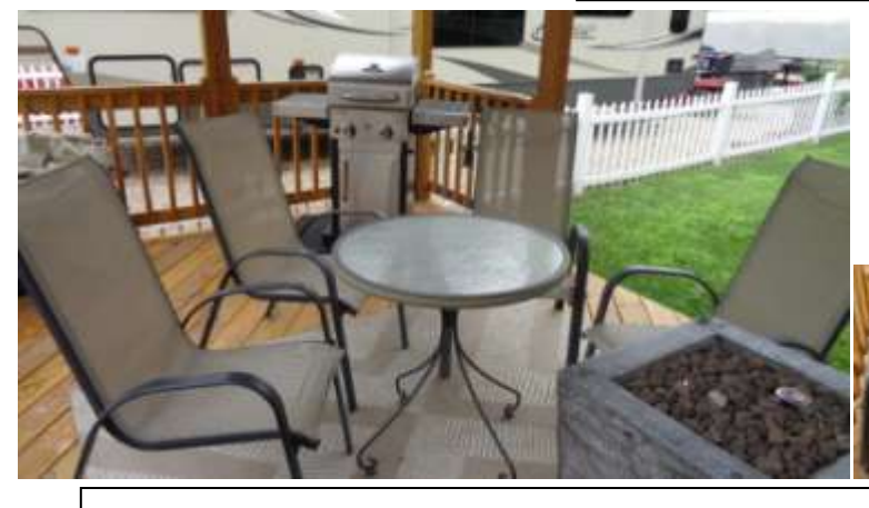
PATIO SET: Table, 4 Chairs, 2 Foot Stools