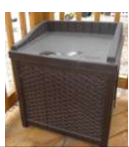
DECK BOX: Suncast