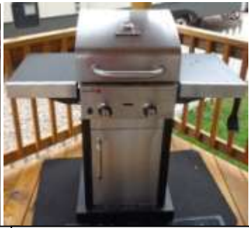
CHAR-BROIL GRILL-Stainless Steel Infrared