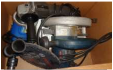
ASSORTED POWER TOOLS