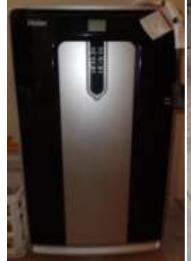
PORTABLE A/C: Haier 2016