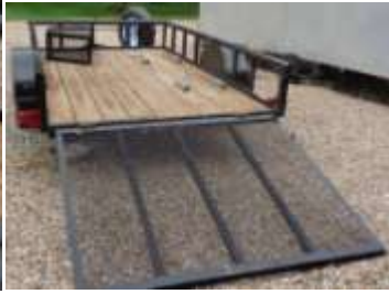
5 1/2x10' Flatbead with Ramp on back-CarryOn 2016 w/spare tire, black utility box, 2990 lb axel w/title