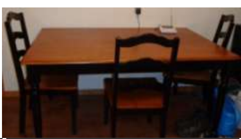
TABLE WITH 4 CHAIRS